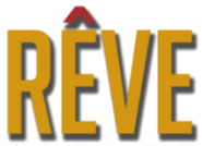
Reve Bistro, Lafayette

Please consider supporting these black-owned businesses near Lafayette, CA.: