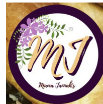
Mama Jannah's Kitchen Concord