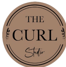
The Curl Studio Walnut Creek