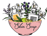
Skin Soup, Lafayette