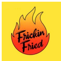
Frickin' Chicken Concord