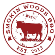
Smokin' Woods BBQ Temescal, Oakland