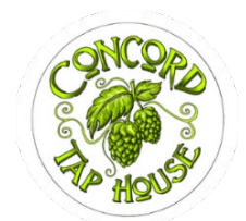
Concord Tap House Oakland