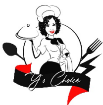
Y's Choice Jack London Square Oakland