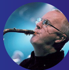
TOM SCOTT SAXOPHONE