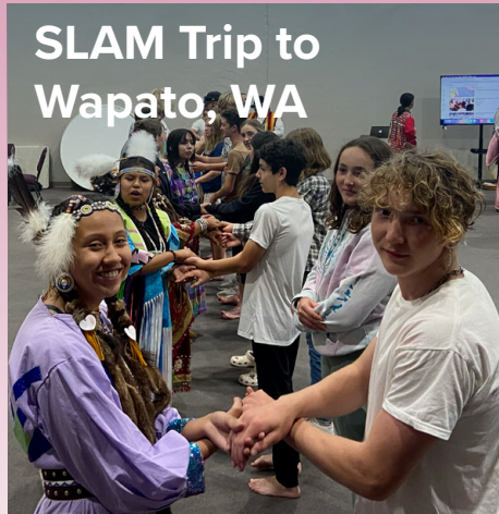
SLAM Trip to Wapato, WA

Service Squad: A Service-Learning Day Camp for youth completing 5th–6th grades in spring 2024.