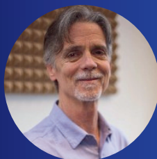
JOHN R. BURR PIANO