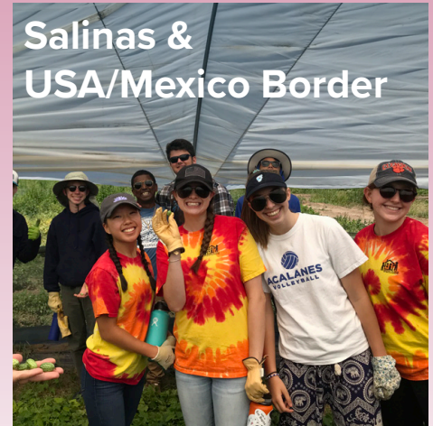
Salinas & USA/Mexico Border

SLAM (Students Learning About Mission) Trip to Wapato, WA , for youth completing 7th–12th grades in spring 2024.