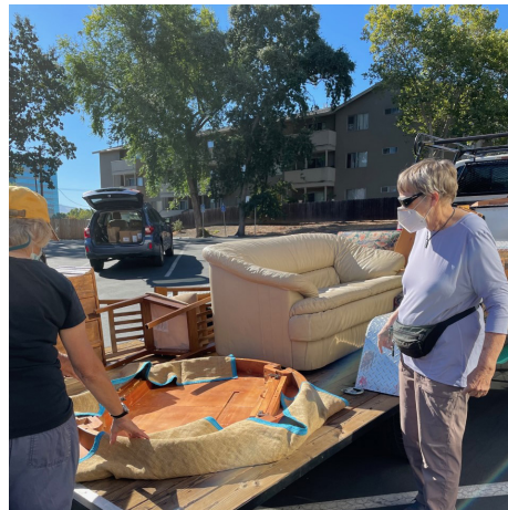
Volunteers assist with donations.

Throughout the process, we've considered how the LOPC community might become involved. At the most recent group meeting, it was decided to work with the Extended Family Program (EFP), organized through Walnut Creek United Methodist