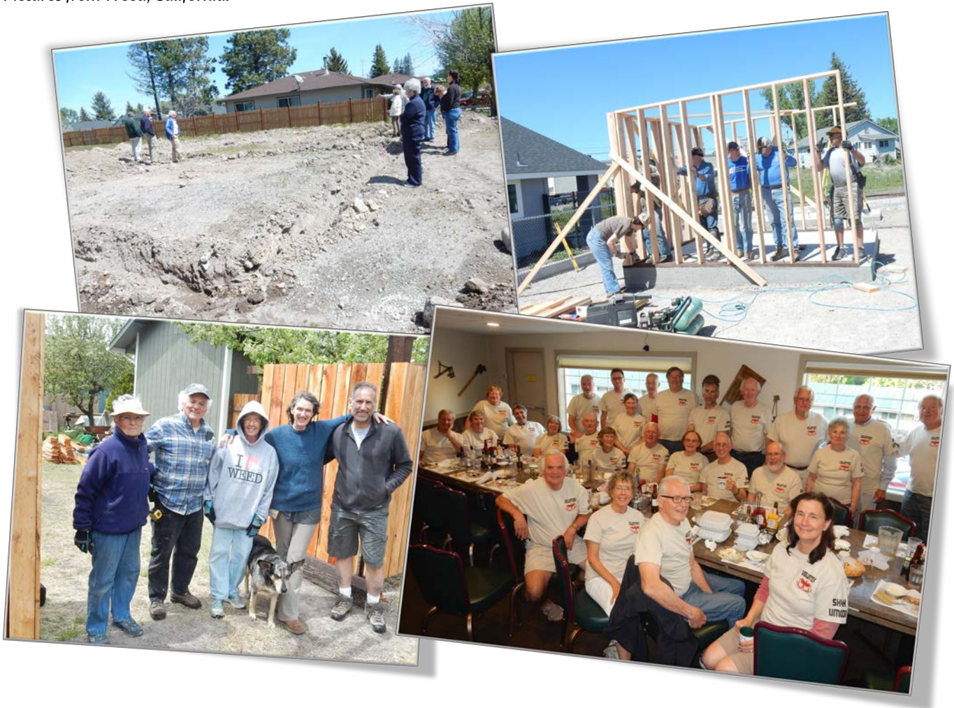
Pictures from Weed, California.