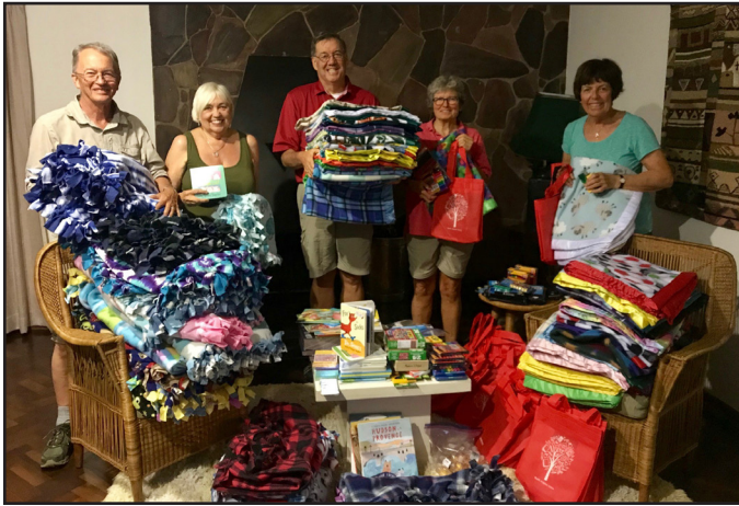
The team preparing to distribute blankets and books to children at a clinic for disabled children.

Upon our arrival in Harare, the capital of Zimbabwe, we were greeted with the headline that the price of bread went from $1 to $4 over a matter of weeks. Rapid inflation is gripping the country again, leading to dramatic price increases and shortages throughout the country.