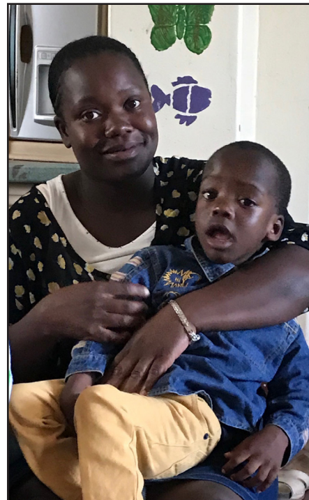
A mother with her son who has cerebral palsy at the Children's Rehabilitation Clinic.

We helped construct one of the two new classrooms, occasionally baffling the school staff and visiting parents who wondered why these older people were working so hard when we should be relaxing, retired. And really baffling the men when our women shoveled gravel, pushed a loaded wheelbarrow, or moved bricks.