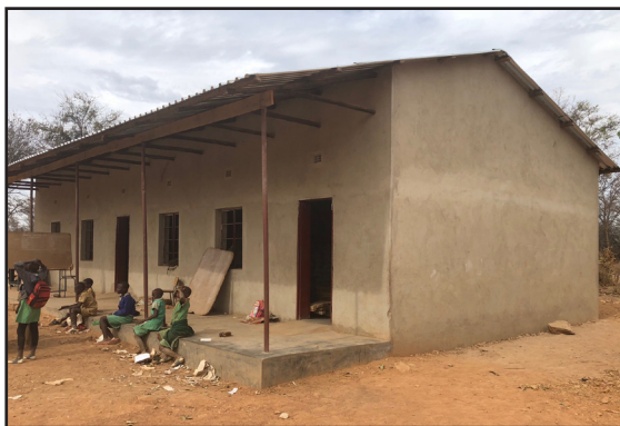
The JF Kapnek School outside Harare.

One day we observed the once-a-term health screening with which KT assists. They transport the District Nurse to the site, as the government has no funds for transportation. Of course, that uses precious gas. Each child is examined for health issues including malnutrition.