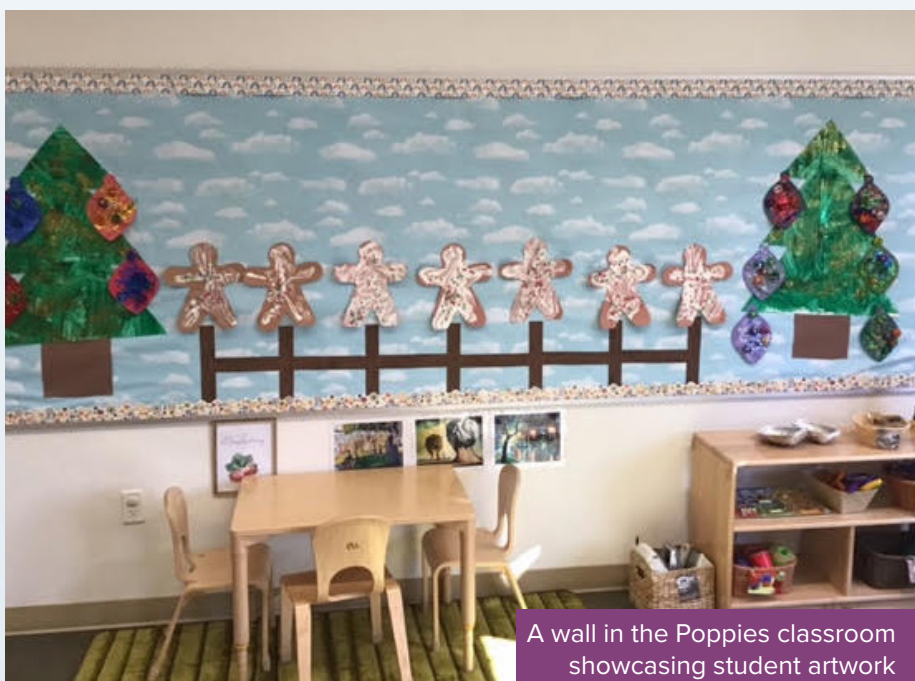
A wall in the Poppies classroom showcasing student artwork

“The students also enjoy circle time very much, [which is] a time when the children often share what they would like to do or sing.” The teachers reported that other fun included monthly themed yoga (December’s yoga theme was ‘Winter Animals’) and movement songs such as Reindeer Pokey (just like ‘okey Pokey’). In December, students especially loved singing “Old Mac Donald had a Christmas Tree.”