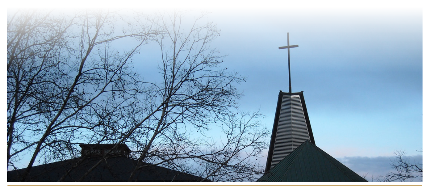
LAFAYETTE-ORINDA PRESBYTERIAN CHURCH

To launch this year's stewardship campaign, the Stewardship Team completed a series of 10:10 programs on Talent – how your gifts and abilities can change the world; Treasure – how to share yours in a way to reflect God's love; and Time – how to use it to create impactful and compassionate change. More information about this year's campaign will be presented during services, in Focus and on the plaza between services. I had the opportunity to lead spiritual formation, a powerful and humbling experience.