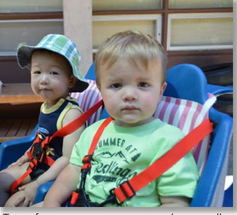
Two of our youngest campers take a stroll.