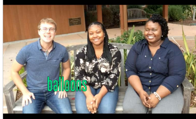
When your sharp words pop someone's balloons, make sure you restore what was broken.